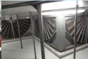
CASEY ARC POOL Cranbourne Victoria