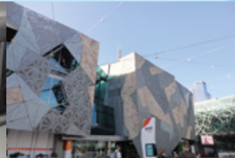
Melbourne's FEDERATION SQUARE for 16 years