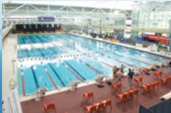
AUST INST of SPORT Canberra Aquatic Centre for 33 years