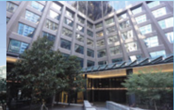
Melbourne's 555 Bourke St James